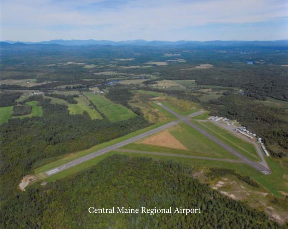
Central Maine Regional Airport

Annual Town Report Year Ending December 31, 2013