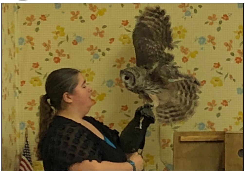
The Chewonki program educator allows an owl to perch on her hand at a recent event sponsored by the Norridgewock Library Trustees.